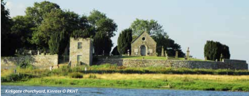
Kirkgate churchyard, Kinross