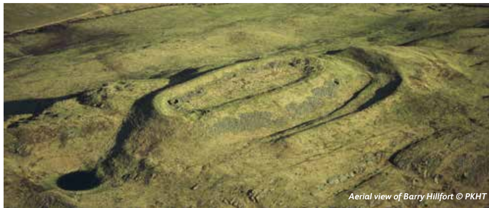
Aerial view of Barry Hillfort