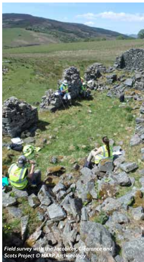
Field survey with the Jacobites, Clearance and Scots Project