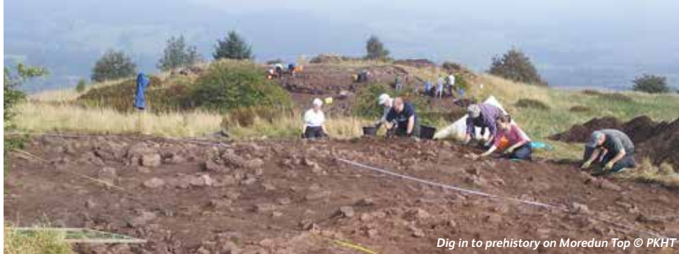
Dig in to prehistory on Moredun Top