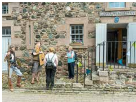
Curious characters from the past at Museum of Abernethy's wee big dig weekend