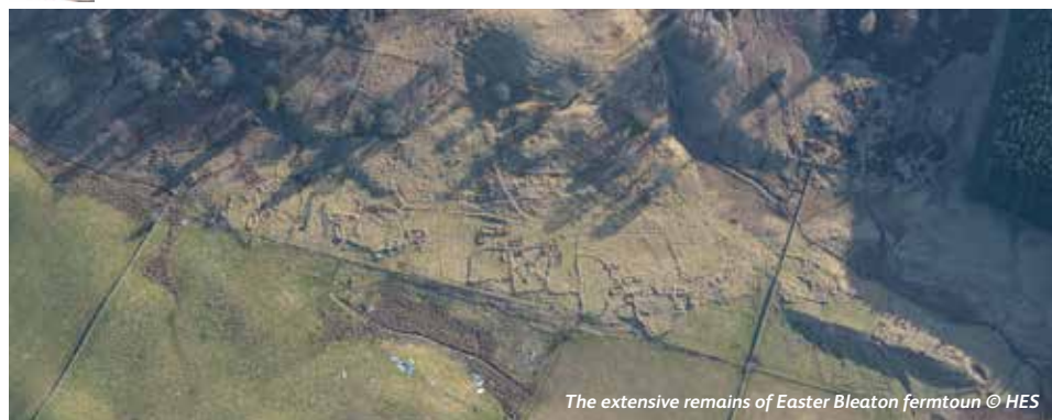
The extensive remains of Easter Bleaton fermtoun