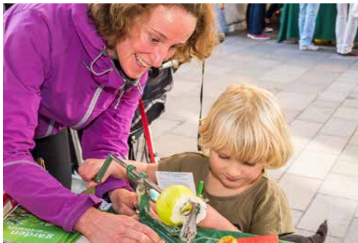
Have a fun day with fruit at the TLP Fruit Heritage Festival