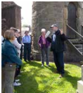
Guided tours of Abernethy Round Tower by Adrian Cox