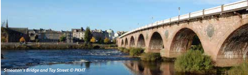
Smeaton's Bridge and Tay Street