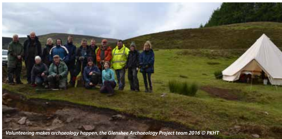
Volunteering makes archaeology happen, the Glenshee Archaeology Project team 2016