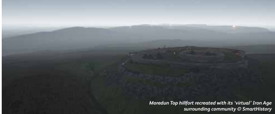
Moredun Top hillfort recreated with its 'virtual' Iron Age surrounding community