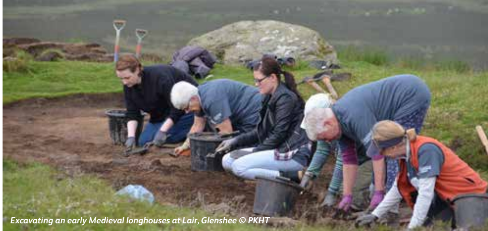
Excavating an early Medieval longhouses at Lair, Glenshee