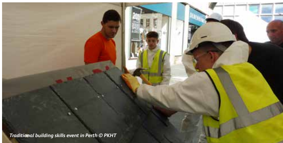
Traditional building skills event in Perth